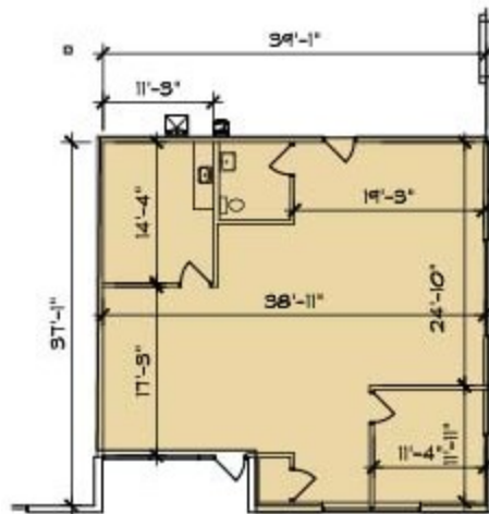
OFFICE PLAN 1,565 SF