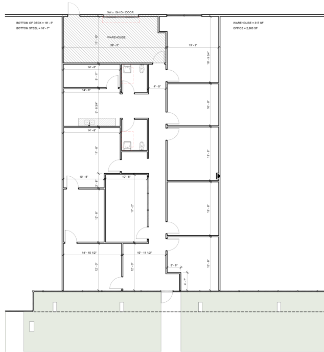
Suite 200 Floor Plan

Building Size: 28,800 SF | Building Availability: 3,000 SF