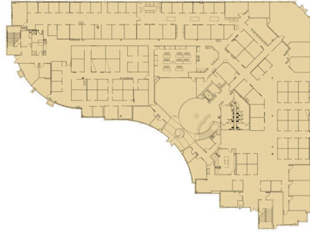
FIRST FLOOR - ±28,340 SQUARE FEET

Building Size: 56,680 SF | Building Availability: 56,680 SF