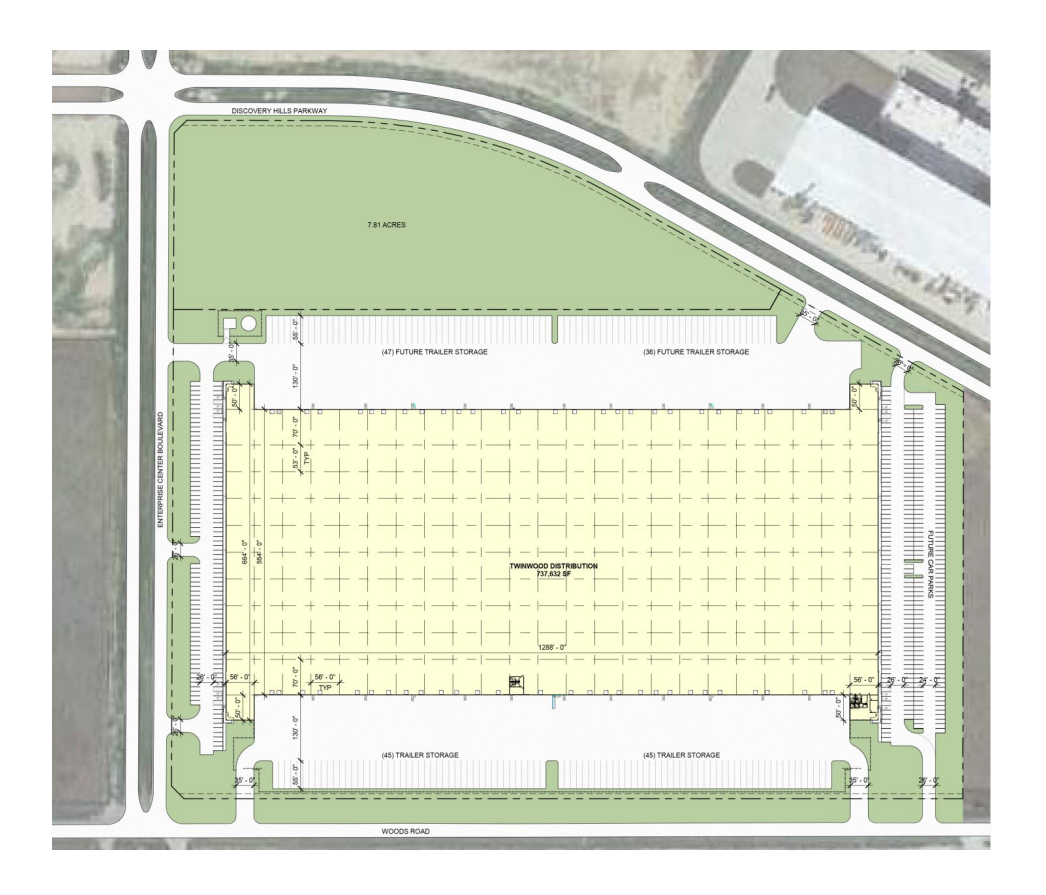
Trailer Storage: option for 232 additional spaces on 7.81 acres

Building Size: 737,632 SF | Building Availability: 737,632 SF